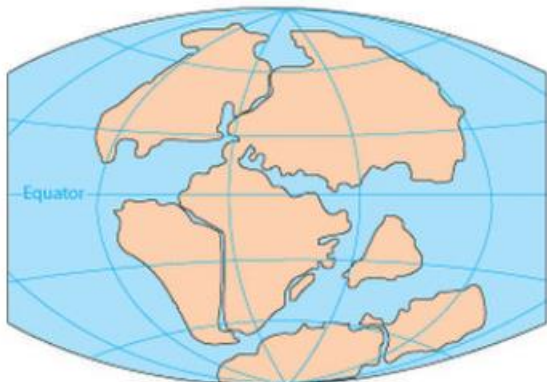
JURASSIC 145 million years ago