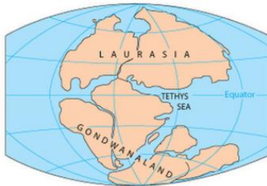
TRIASSIC 200 million years ago